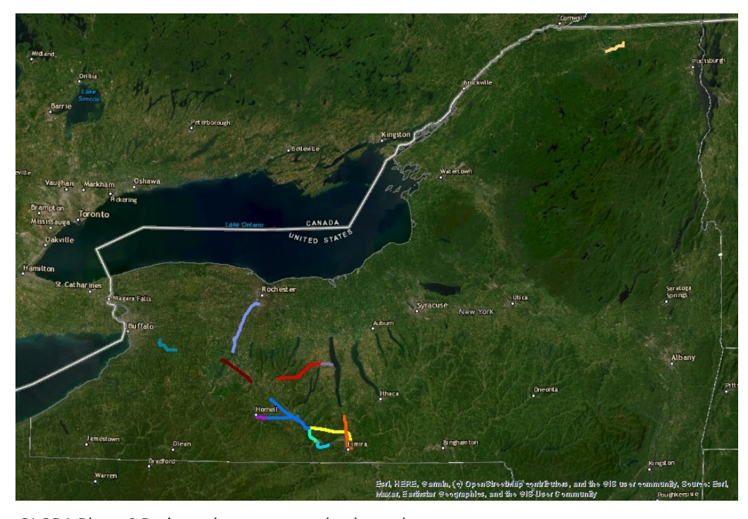
CLCPA Phase 2 Projects that are currently planned.

In total, Avangrid has committed to executing approximately $3.5B on CLCPA projects (*combined Phase 1 & 2) by 2030 in support of NYS climate goals.